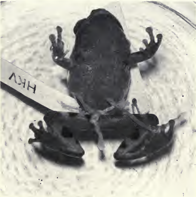
FIG. 9. Philautus abditus , new species. Paratype, male, 28.1 mm.