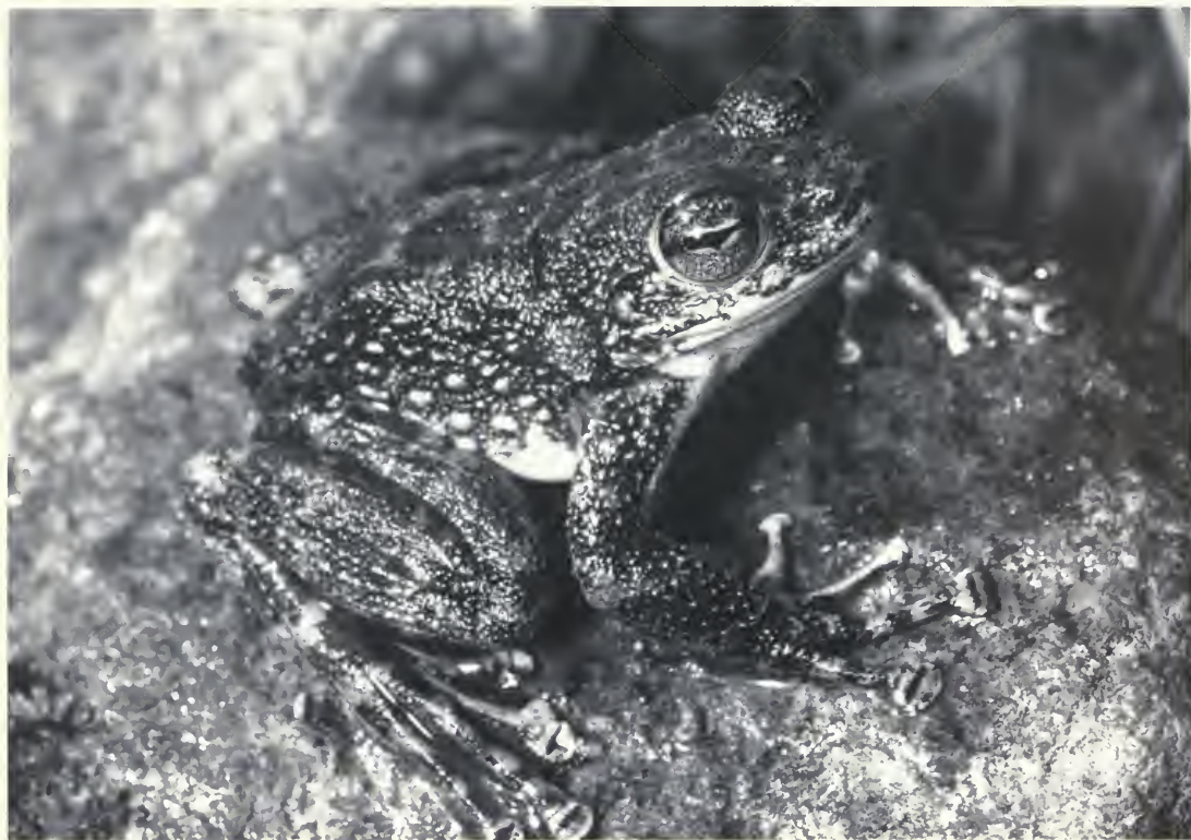
FIG. 4. Amolops spinapectoralis , new species.