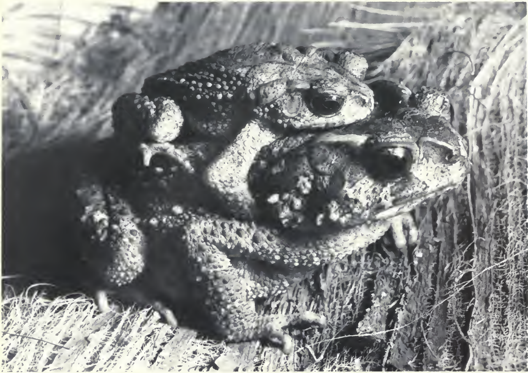
FIG. 3. Bufo galeatus Günther. Pair in amplexus. Male, 50.5 mm; female, 85.3 mm.