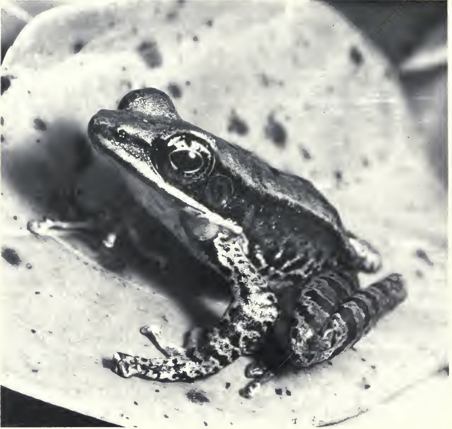
FIG. 8. Rana nigrovittata (Blyth). Male, 52.9 mm.

15), of females 0.37–0.41 (median 0.390, N = 16 ); tympanum/SVL of males 0.081–0.109 (median 0.093, N = 15 ), of females 0.074–0.091 (median 0.083, N = 16 ). Differences between the sexes in these three body proportions are significant at the P < 0.01 level (Mann-Whitney U -test).