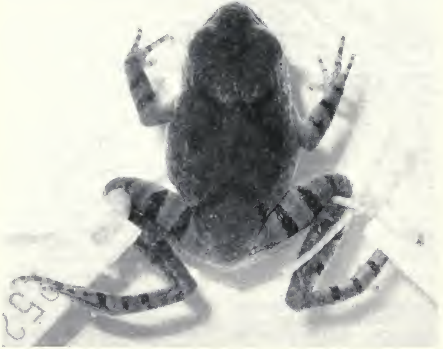
FIG. 2. Leptotalax tuberosus , new species. Holotype, male, 26.1 mm.

a small, oval inner metatarsal tubercle, no outer one.