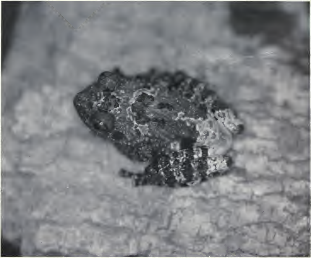
FIG. 18. Theلودerma stellatum Taylor. Female, 32.3 mm.

One specimen was found on the trunk of a fallen tree in a small forest clearing. Another was perched on the broad leaf of a shrub about 5 m from a forest stream.