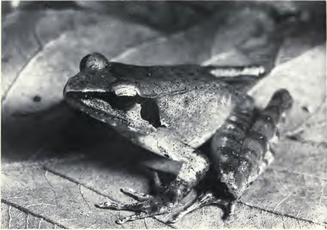
FIG. 7. Rana johnsi Smith. Female, 46.7 mm.

on the second finger. The first and fifth toes have movable flaps of skin externally. The first three toes and the fifth are fully webbed to the base of the swollen tips. There are two wide, black bars from the eye to the lip. The upper half of the tympanum and the supratympanic fold are covered by a black streak. In about one-fourth of the individuals, there is a light vertebral stripe.