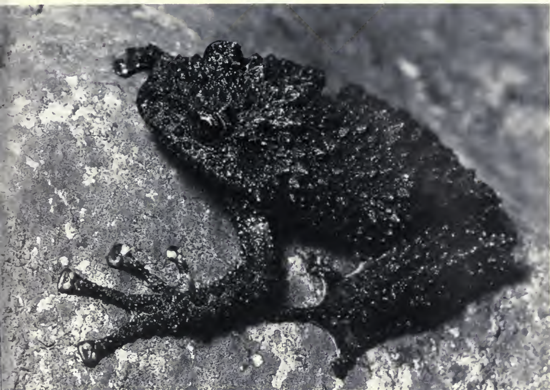
FIG. 17. Theloderma corticalis (Boulenger). Female, 70.0 mm.

ram Lap, and one female from Tam Dao. These are clearly conspecific with the holotype of T. gordonii (FMNH 172248). The skin is extremely rough, with many pustulose ridges and tubercles on top of the head, temporal region, back, and dorsal and lateral surfaces of the limbs. There is a very dense cluster of large spinose tubercles or warts behind the tympanum, and the chin and throat have small pustulose tubercles, in sharp contrast with the smoothly granular chest and belly. The vomerine teeth are in small, widely separated, oblique groups near the anterior corners of the choanae. The distinct tympanum is slightly more than half the diameter of the eye. The Tam Dao female differs from the other two in having the warts of the dorsal warts coalesced into ridges. In life, these frogs were almost black dorsally and laterally, with the crests of some ridges on the head and back light brown. In preservative, the cluster of warts behind the tympanum is pale brown. The palmar tubercles and prehallux are white (flesh-colored in life?), in sharp contrast to the dark color of the remainder of the ventral surface of the hand; although the holotype is faded, it is still possible to see a contrast between the