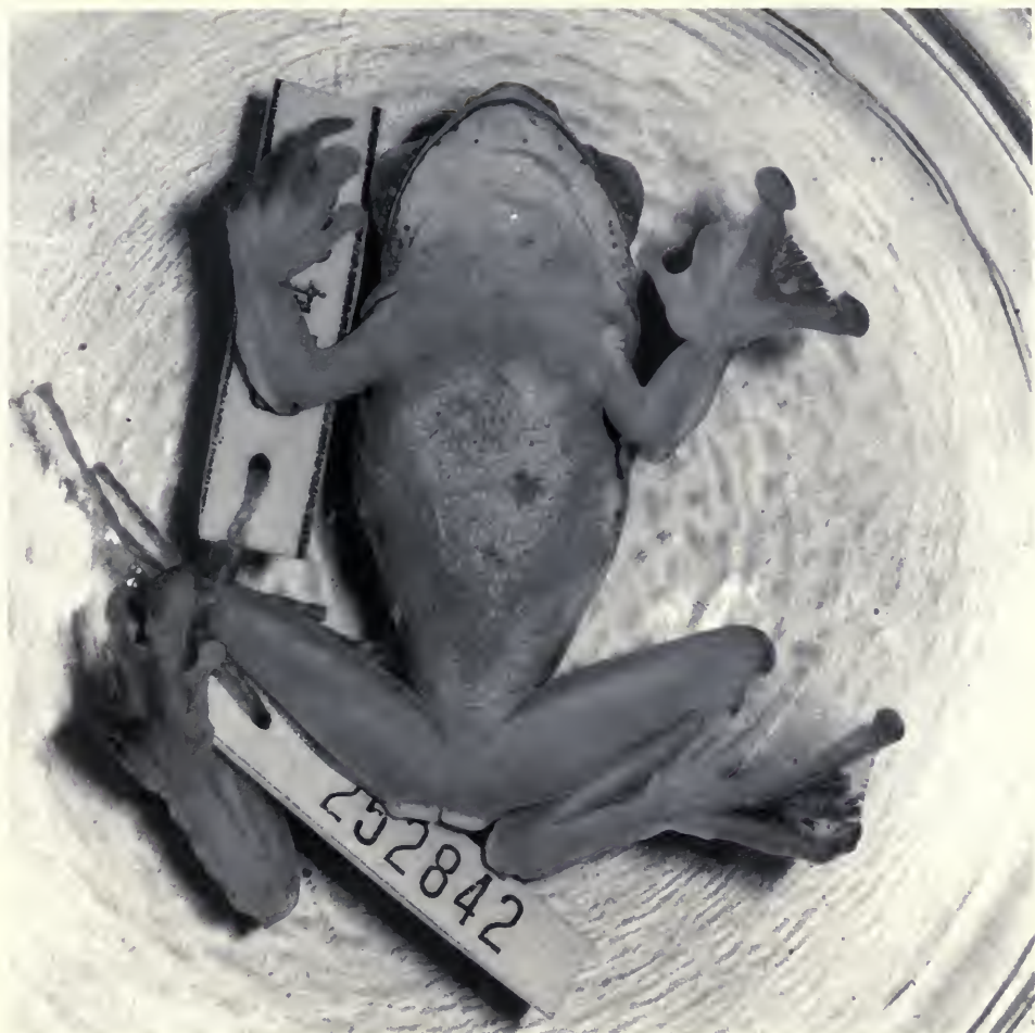
FIG. 15. Rhacophorus exechopygus , new species. Paratype, male, 46.4 mm.

work in upper half, darker in lower half. In preservative uniform purplish gray on all dorsal surfaces and upper half of side; lower part of side with black band from axilla to groin, or black at axilla and groin only, or with a row of large black spots; one specimen with light spots (blue in life?) within black area at groin; throat and abdomen white; rear face of thigh black; front face of thigh white or black; ventral surface of calf black or white; dorsal surface of outer fingers and toes with coloration of back, inner digits without dark pigment; web dark on dorsal surface, colorless or pale reddish ventrally.