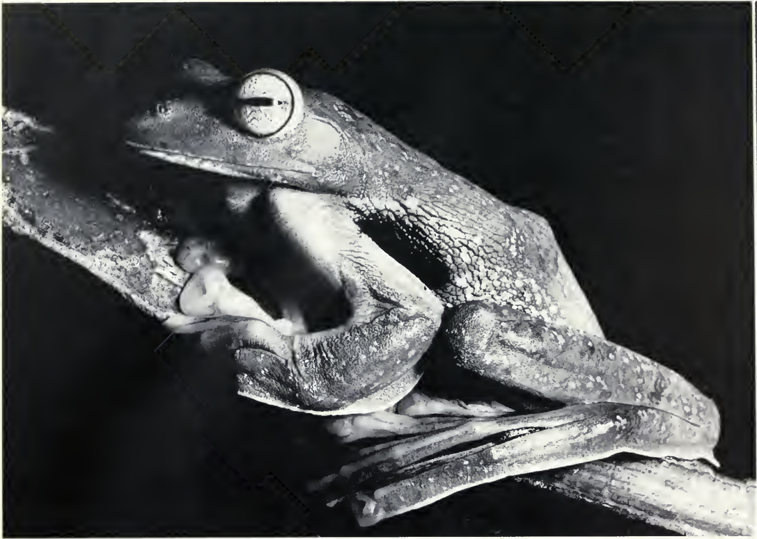
FIG. 16. Rhacophorus reinwardtii (Schlegel). Female, 85.2 mm.

pygus differs from other syntopic species of Rhacophorus in dermal appendages ( R. verrucosus Boulenger, R. bipunctatus Ahl, R. annamensis Smith, R. calcaneus Smith, and R. baliogaster , new species, without a wide infra-anal projection) and coloration ( R. baliogaster with boldly spotted abdomen, R. bipunctatus with black spots on the side, R. calcaneus with dark dorsal markings, and R. annamensis with black dotted throat). Other Rhacophorus from Southeast Asia differ from R. exechopygus in (1) the type of dermal appendages ( R. appendiculatus [Günther] with strong crenulated fringe or row of conical tubercles along forearm and tarsus; R. taronensis Smith and R. turpes Smith without infra-anal projection), and (2) coloration (none of the listed species has an immaculate dorsal pattern).