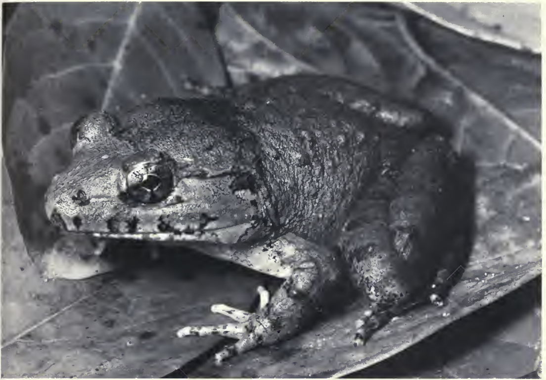
FIG. 6. Rana cf. blythii . Male, 73.8 mm.

evations from 700 to 1200 m ASL. Males have enlarged odontoids at the front of the mandible and distinctly enlarged heads, but they lack nuptial pads and vocal sacs. The tympanum is superficial. Although these frogs are clearly part of the R. blythii species group, they differ significantly in a number of ways from typical R. blythii of the Malay Peninsula and Thailand. In the Vietnam