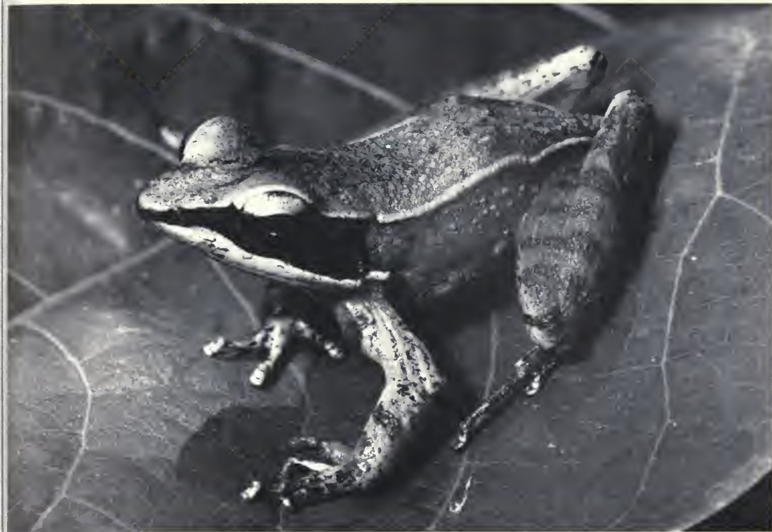
FIG. 5. Rana attigua , new species. Male, 44.9 mm.

of hind limb with tubercles; ventral surfaces smooth.