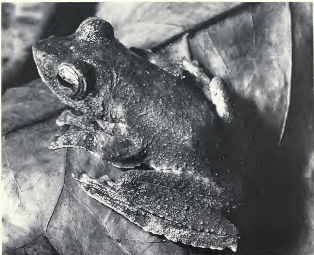
FIG. 14. Rhacophorus exechopygus , new species. Holotype, male, 46.5 mm.

Vietnam, 21 April 1995 by Ilya Darevsky and Nikolai Orlov.