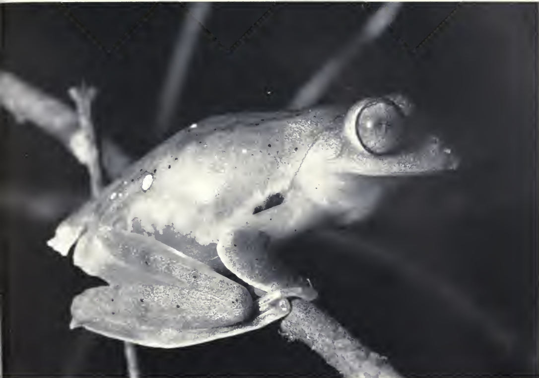
FIG. 12. Rhacophorus bipunctatus Ahl. Male, 37.3 mm.