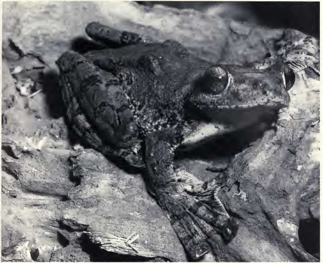
FIG. 10. Rhacophorus annamensis Smith. Female, 84.5 mm.

resembles the male of the type series in this character.