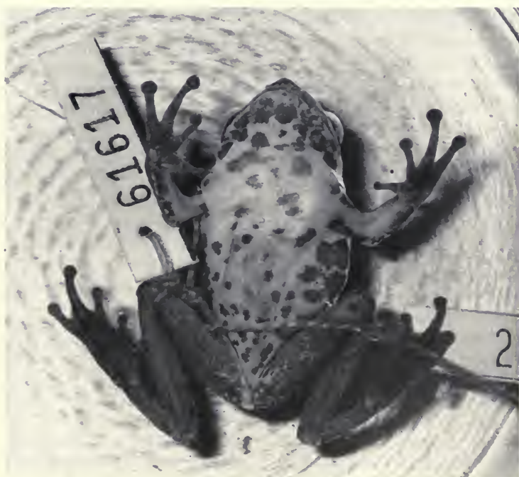
FIG. 11. Rhacophorus baliogaster , new species. Holotype, male, 33.0 mm.