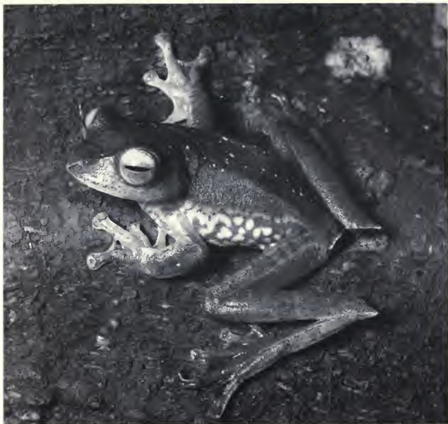
FIG. 13. Rhacophorus calcaneus Smith. Male, 35.4 mm.

network enclosing large white spots; iris light tan or yellowish brown in upper half, darker grayish brown below; front and rear of thigh reddish brown. In preservative ground color dorsally gray or pinkish; no large black spots laterally in present sample; lateral black network faint in some individuals; supra-anal ridge pinkish white; ventrally white usually with fine dark dots or immaculate white; limbs with dark crossbars; ventral surfaces of thigh and calf with small black dots; front and rear of thigh pale pinkish or flesh-colored, immaculate (10) or dotted with black (4), or rear of thigh dark brown (11).